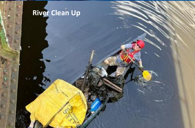
River Clean Up