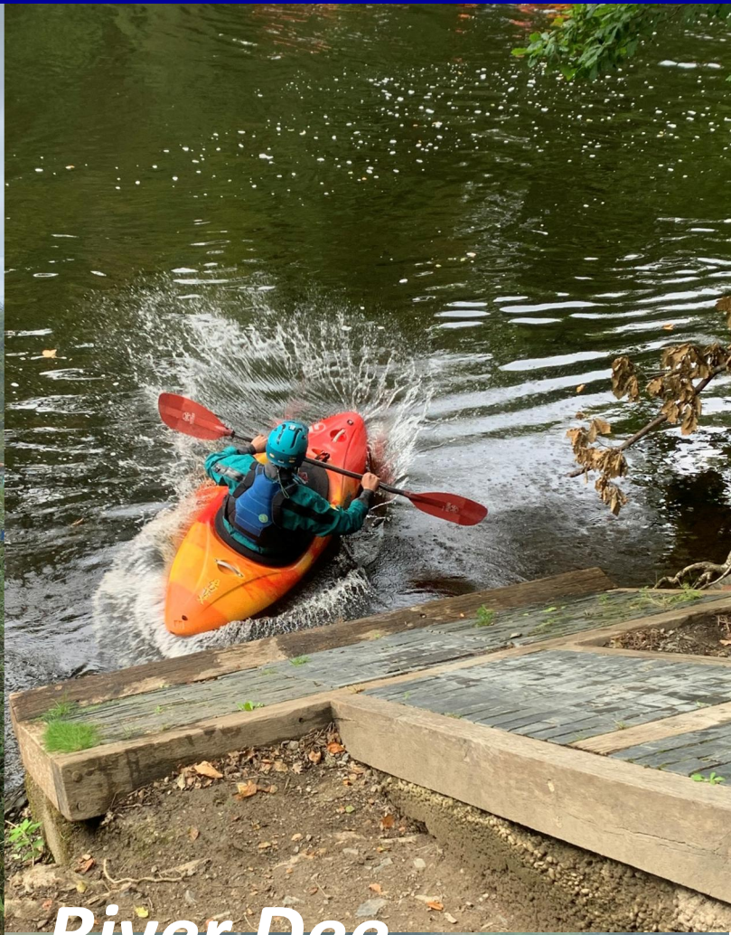
Llangollen - River Dee