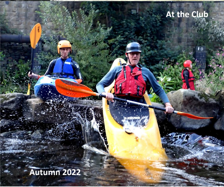
At the Club