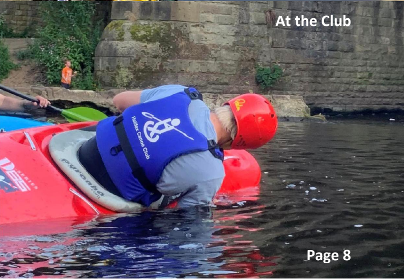
At the Club