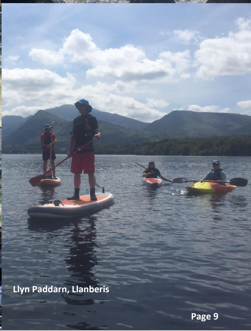
Llyn Paddarn, Llanberis