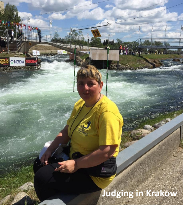
Judging in Krakow