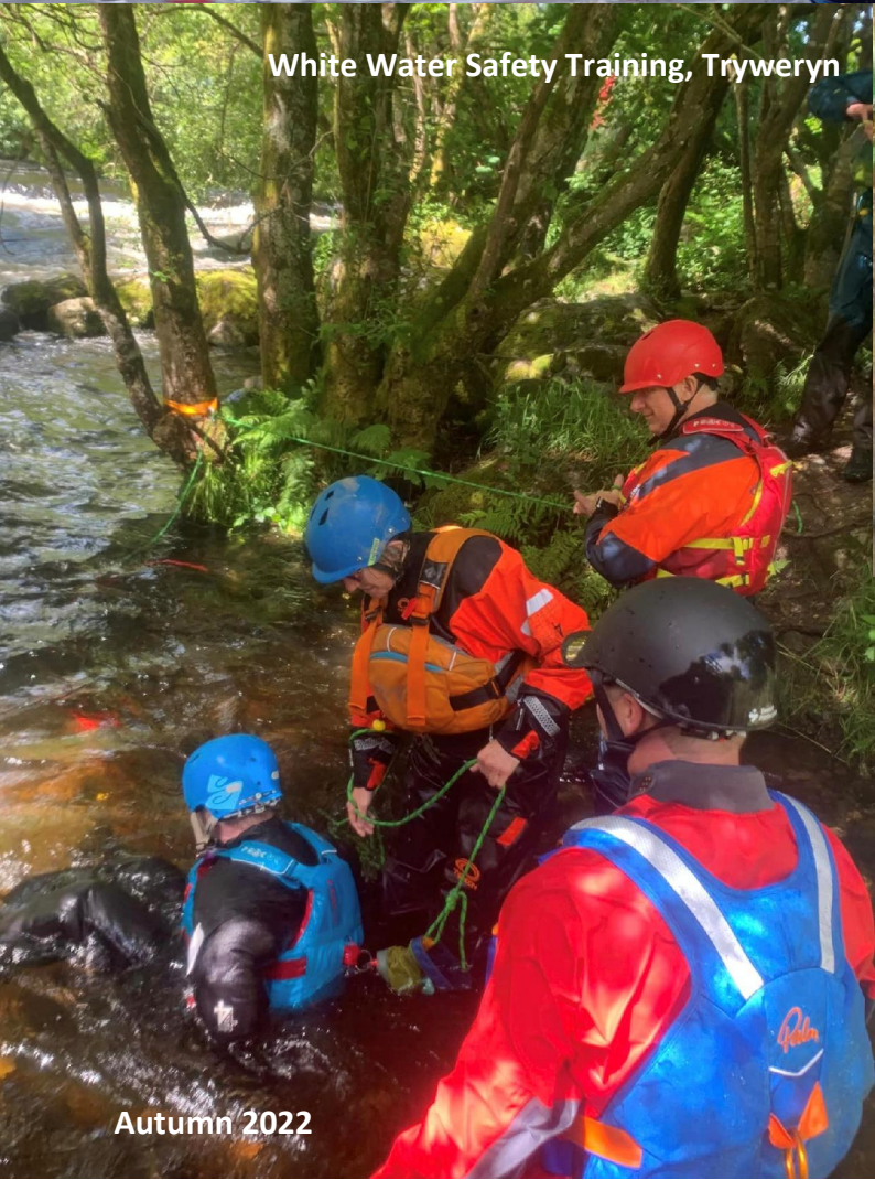
White Water Safety Training, Tryweryn