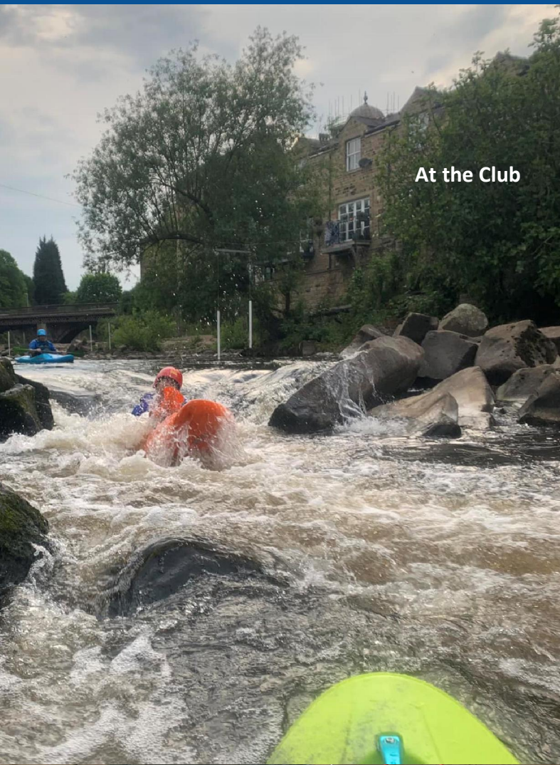
At the Club