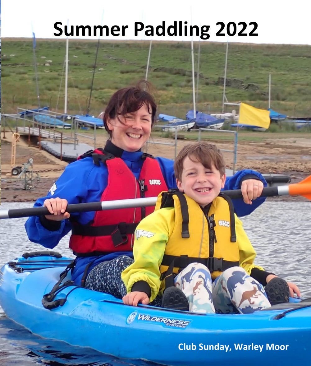
Club Sunday, Warley Moor